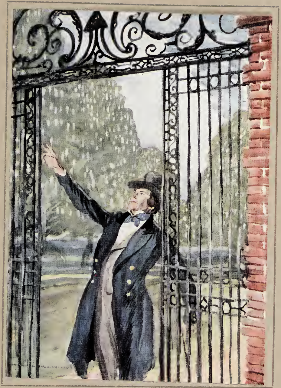
"THE BAR OF 'THE GATE.'"